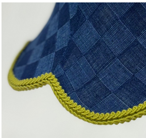
LEFT: scallops trimmed with gimp braid

So in brief, a scalloped edge should be trimmed with a scroll gimp, which hugs the curves well. If you choose a shade with straight top and bottom rings, your options are broader and bias trim or ribbon will both work well.